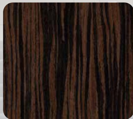
Qtr. Macassar Ebony EB-7001S