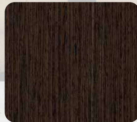
Qtr. African Wenge TD-5843S