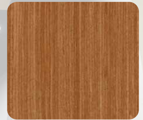
VG Fir Fir-3Q