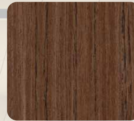
Qtr. Teak TK-016S