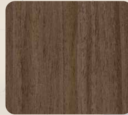
Qtr. Walnut WT-139S