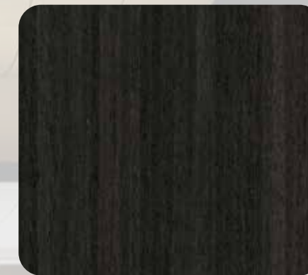
Qtr. Gun Metal Ebony WT-2450S