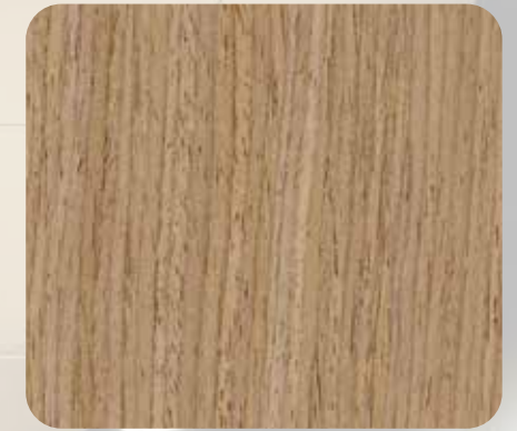
Rift White Oak Oak-12-1S