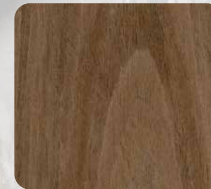
PS Walnut WT-3160C