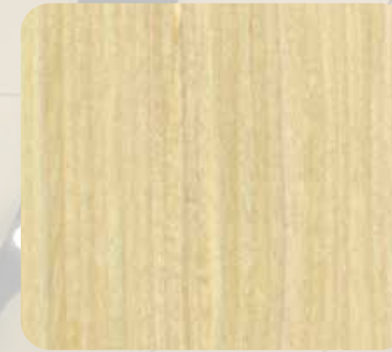
Qtr. Maple MP-168S