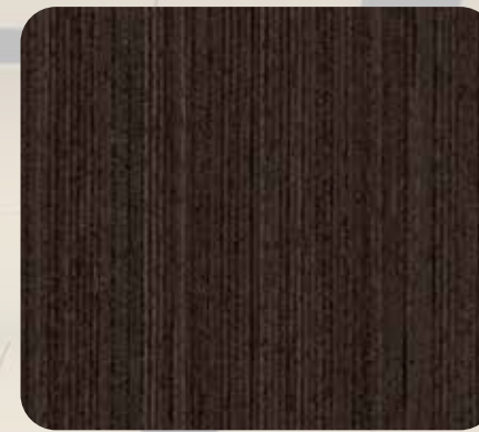
Qtr. Wenge WG-111Q