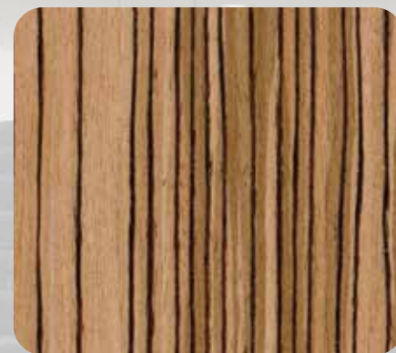
Qtr. Zebrano ZB-011S