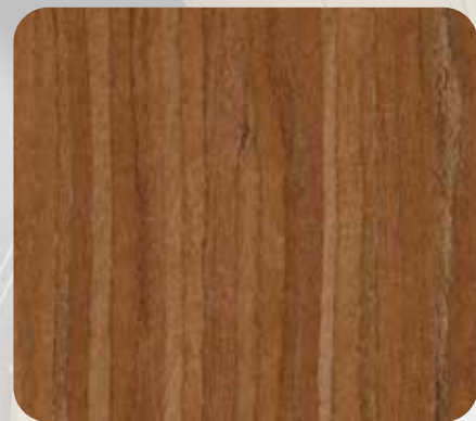
Qtr. Cherry CH-311S