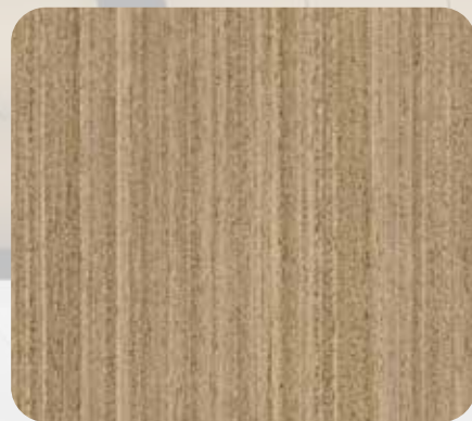
Qtr. Champagne Champ-2Q