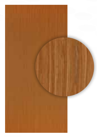
Qtr Cherry CH – 311S