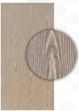
Napa W.0ak – 801C