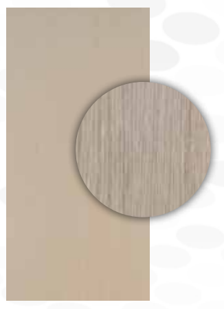
Monterey W.Oak – 09S