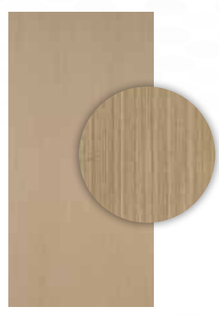
Qtr Champagne Champ – 2Q