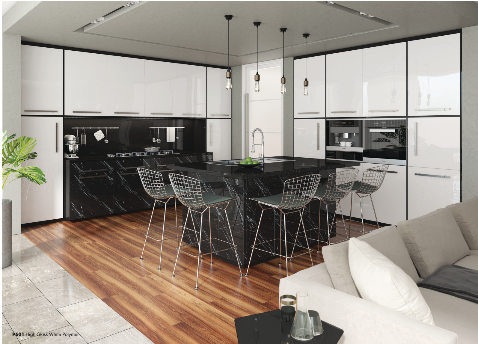
P601 High Gloss White Polymer